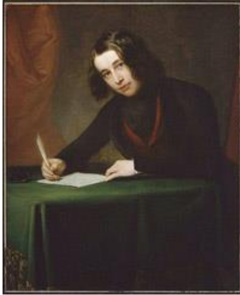
Charles Dickens (1842) Francis Alexander (1800-1880) Wikipedia